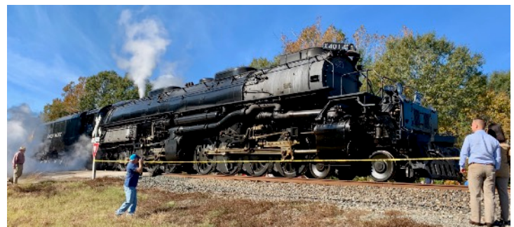
Big Boy No. 4014 in Troup, Texas, November 10, 2019