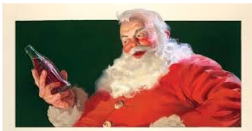
Modern Day American Santa Claus, 2000 AD