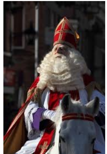
Sinter Klaus, Germany, 1500 AD

The Germans pronounce Saint Nicholas as Sinter Klaus , which became Santa Claus in English. Christ Child is Kris Kindle in German and " Chris Kringle " became a popular English nickname for Santa Claus. While Martin Luther's intention was to suppress St. Nicholas, the end result was that Saint Nicholas, Sinter Klaus and Santa Claus ended up becoming Christmas guests. As we trace the history, appearance and name of Saint Nicholas throughout his multi-cultural history, it is easy to see how Santa became a part of the world's most famous birthday.