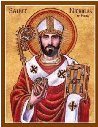
Saint Nicholas of Myra 315 AD

Saint Nicholas of Myra was born about 280 AD in the Eastern Mediterranean or what is now Demre, Turkey. His wealthy parents died at a young age and Nicholas inherited significant wealth. The young Nicholas was raised by his uncle, who encouraged Nicholas to become a priest.